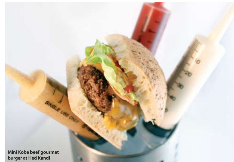
Mini Kobe beef gourmet burger at Hed Kandi