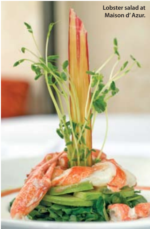
Lobster salad at Maison d'Azur.