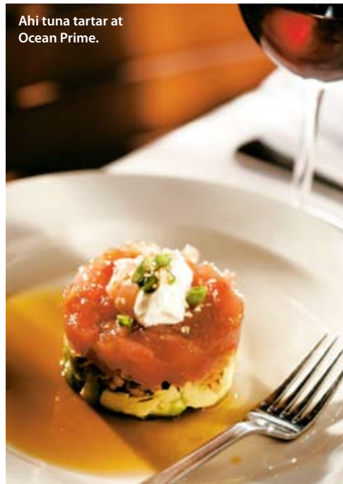
Ahi tuna tartar at Ocean Prime.

The Grill on the Alley's menu stays traditional offering the finest available USDA Prime steaks and chops, fresh seafood and soups and desserts made from scratch. Take a break after a long day of shopping to savor the delectable lobster martini appetizer, fresh crab Louie or the braised short ribs complemented by a comprehensive and moderately priced wine list that includes boutique wineries from California, South America and Europe.