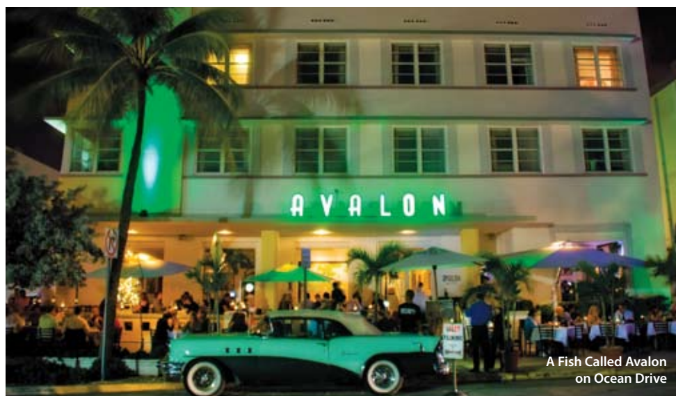
A Fish Called Avalon on Ocean Drive

Social Affair's gourmet guide to South Florida's top restaurants.