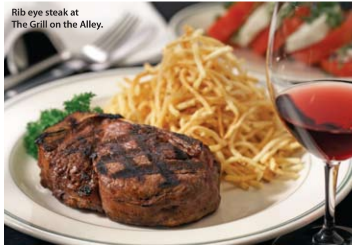
Rib eye steak at The Grill on the Alley.

Latin meets Asian in Sleeping Beauty's Castle to entice your appetite and sense of fantasy and adventure. This fusion travels the spice route from Tokyo to Havana in ways Marco Polo could only dream of. Enjoy the Tropical Hoisin Roasted Duck with Asian micro greens, sweet plantains, papaya salsa and tropical duck jus or the Lobster Mait Tai and rub shoulders with other Miami's A-listers and power players in this posh new eatery.