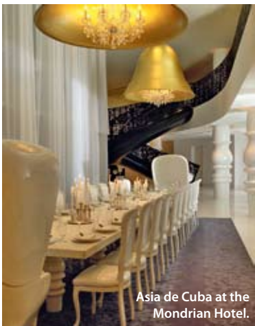
Asia de Cuba at the Mondrian Hotel.

This culinary enclave is nestled in Miami Beach's Astor Hotel, bringing together French and Mediterranean cuisine and one of the most glamorous dining rooms in South Florida. The plates are simple and unpretentious, yet delicate and sophisticated. Rare ingredients are flown daily from around the globe and flavors speak for themselves. Seafood towers, an exquisite selection of caviar and exclusive cuts of meats and poultry place this hidden gem among the best of the beach.